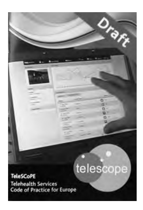
Figure 1 Cover page of the TeleSCoPE – Telehealth Services Code of Practice for Europe.

The Code preparation works are based on several foundation documents covering literature review on telehealth evidence (Foundation Paper 3),